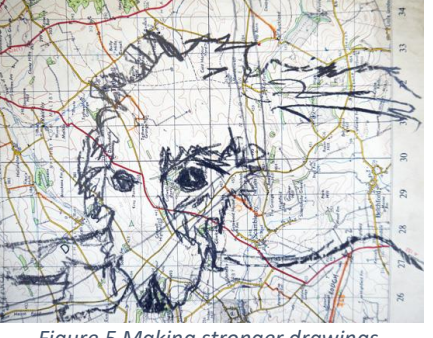
Figure 5 Making stronger drawings