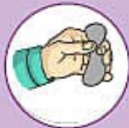
Squeezing the clay