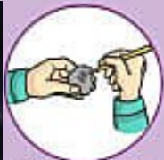
Carving details into the clay with tools