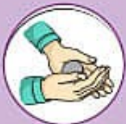
Rolling a ball of clay