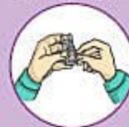
Joining pieces of clay together