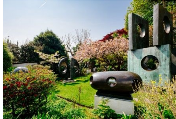
The Barbara Hepworth Museum and Sculpture Garden is in St Ives, Cornwall