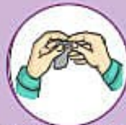
Smoothing out the clay with your fingers