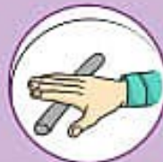
Rolling snakes with clay