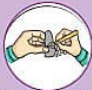
Creating holes or hollows in the clay with tools