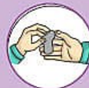
Pulling and pinching the clay with your fingers